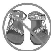
Sandals or Slippers

Participants are requested to arrive in a timely fashion for all addresses. Presenters are reminded that the time slots should be divided fairly and equally by the number of presentations, and that they should not overrun. The session chair is asked to assume this timekeeping role and to summarize key issues in each topic.