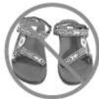
Sandals or Slippers

Participants are requested to arrive in a timely fashion for all addresses, whether to their own, or to those of other presenters. Presenters are reminded that the time slots should be divided fairly and equally between the number of presentations, and that they should not overrun. The session chair is asked to assume this timekeeping role and to summarize key issues in each topic.